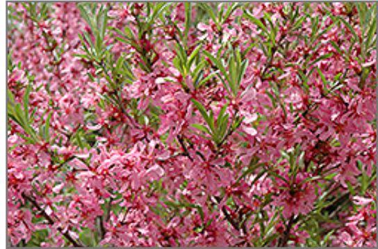
Russian Almond flowers