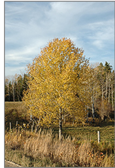
Trembling Aspen in fall

This tree should only be grown in full sunlight. It is an amazingly adaptable plant, tolerating both dry conditions and even some standing water. It is considered to be drought-tolerant, and thus makes an ideal choice for xeriscaping or the moisture-conserving landscape. It is not particular as to soil type or pH. It is quite intolerant of urban pollution, therefore inner city or urban streetside plantings are best avoided. This species is native to parts of North America.