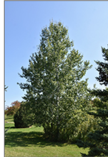
Trembling Aspen

Trembling Aspen is recommended for the following landscape applications;