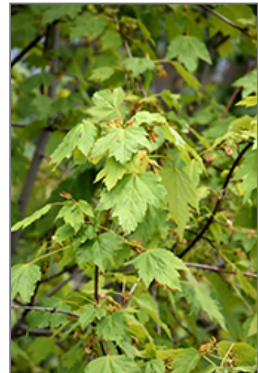
Rocky Mountain Maple foliage