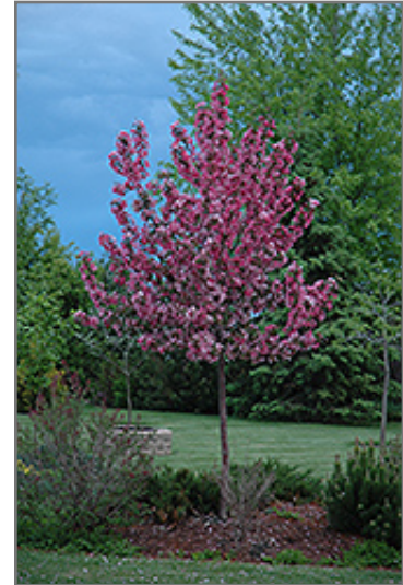
Rudolph Flowering Crab in bloom

Rudolph Flowering Crab is recommended for the following landscape applications;