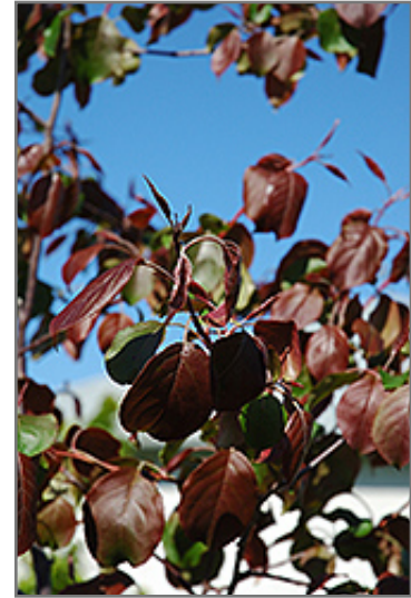
Rudolph Flowering Crab foliage

This tree should only be grown in full sunlight. It prefers to grow in average to moist conditions, and shouldn't be allowed to dry out. It is not particular as to soil type or pH. It is highly tolerant of urban pollution and will even thrive in inner city environments. This particular variety is an interspecific hybrid.