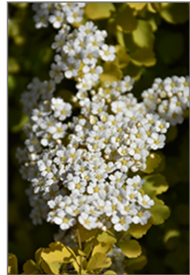
Glow Girl Birch Leaf Spirea flowers