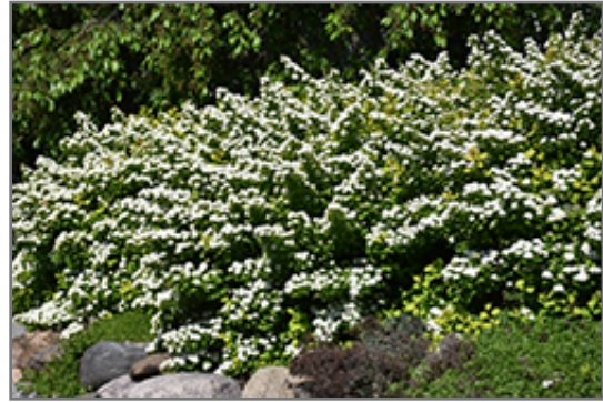
Glow Girl Birch Leaf Spirea in bloom

Glow Girl Birch Leaf Spirea is recommended for the following landscape applications;