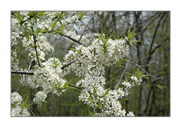
American Plum flowers

This tree is typically grown in a designated area of the yard because of its mature size and spread. It should only be grown in full sunlight. It does best in average to evenly moist conditions, but will not tolerate standing water. It is not particular as to soil type or pH. It is somewhat tolerant of urban pollution. This species is native to parts of North America.