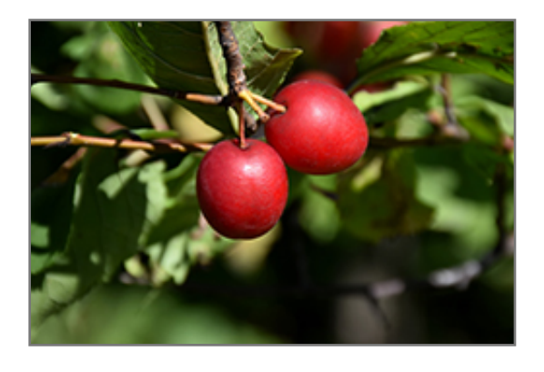
American Plum fruit

American Plum is clothed in stunning clusters of fragrant white flowers along the branches in early spring before the leaves. It has green deciduous foliage. The pointy leaves turn an outstanding yellow in the fall. The fruits are showy gold drupes with a ruby-red blush, which are displayed in mid summer. The fruit can be messy if allowed to drop on the lawn or walkways, and may require occasional clean-up. The smooth brown bark adds an interesting dimension to the landscape.