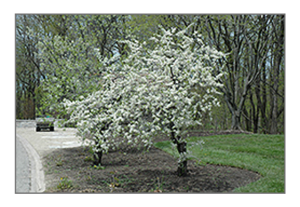
American Plum in bloom