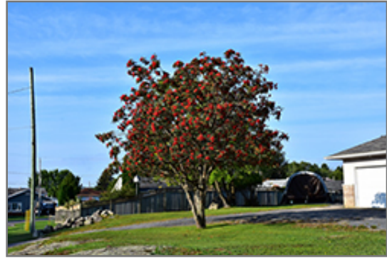
Showy Mountain Ash fruit