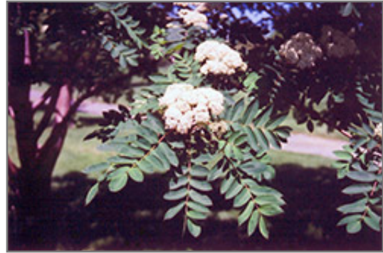
Showy Mountain Ash flowers

This tree should only be grown in full sunlight. It is very adaptable to both dry and moist locations, and should do just fine under average home landscape conditions. It is not particular as to soil type or pH. It is highly tolerant of urban pollution and will even thrive in inner city environments. This species is native to parts of North America.