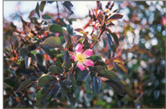
Red Leaf Rose flowers

This is a high maintenance shrub that will require regular care and upkeep, and is best pruned in late winter once the threat of extreme cold has passed. It is a good choice for attracting bees to your yard. Gardeners should be aware of the following characteristic(s) that may warrant special consideration;