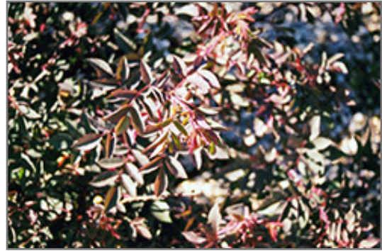
Red Leaf Rose foliage

This shrub should only be grown in full sunlight. It does best in average to evenly moist conditions, but will not tolerate standing water. It is not particular as to soil type or pH. It is highly tolerant of urban pollution and will even thrive in inner city environments. This species is not originally from North America.