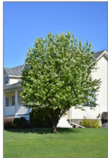
Amur Cherry