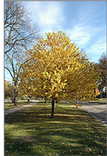
Amur Cherry in fall

This tree should only be grown in full sunlight. It does best in average to evenly moist conditions, but will not tolerate standing water. It is not particular as to soil type or pH. It is somewhat tolerant of urban pollution. This species is not originally from North America.