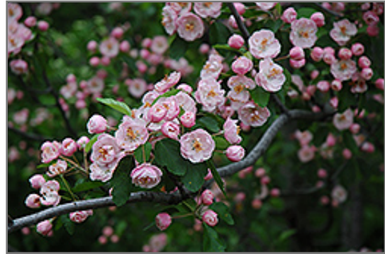
Bechtel's Flowering Crab flowers