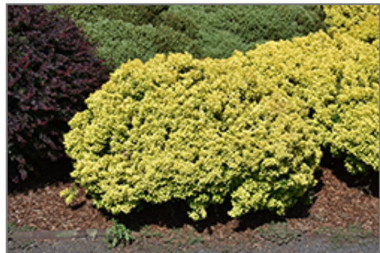
Golden Nugget Japanese Barberry