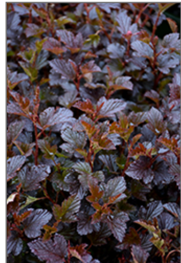
Petite Plum Ninebark foliage