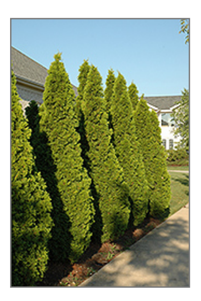
Emerald Green Arborvitae