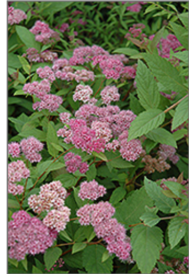
Froebelii Spirea flowers

This shrub will require occasional maintenance and upkeep, and is best pruned in late winter once the threat of extreme cold has passed. It is a good choice for attracting butterflies to your yard, but is not particularly attractive to deer who tend to leave it alone in favor of tastier treats. It has no significant negative characteristics.