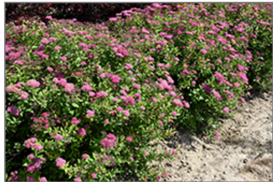
Froebelii Spirea in bloom