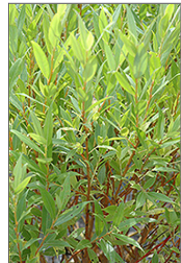
Flame Willow foliage