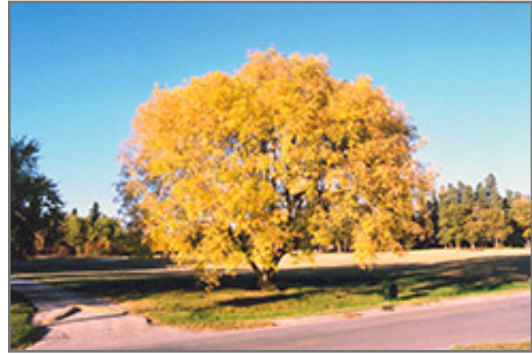
Boxelder in fall