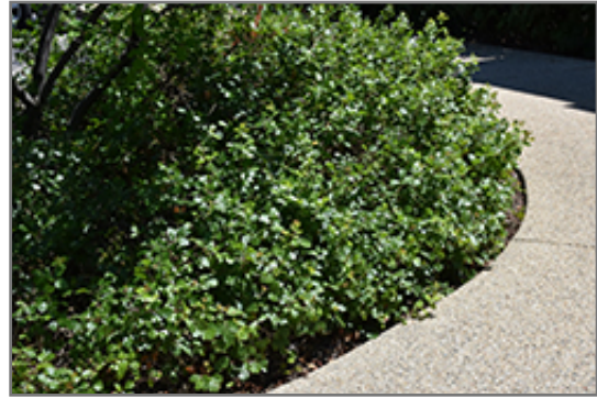
Gro-Low Fragrant Sumac

Gro-Low Fragrant Sumac is recommended for the following landscape applications;