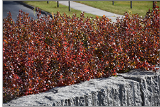
Gro-Low Fragrant Sumac in fall

This shrub performs well in both full sun and full shade. It is very adaptable to both dry and moist locations, and should do just fine under typical garden conditions. It is not particular as to soil type, but has a definite preference for acidic soils, and is subject to chlorosis (yellowing) of the foliage in alkaline soils. It is highly tolerant of urban pollution and will even thrive in inner city environments. Consider applying a thick mulch around the root zone in winter to protect it in exposed locations or colder microclimates. This is a selection of a native North American species.