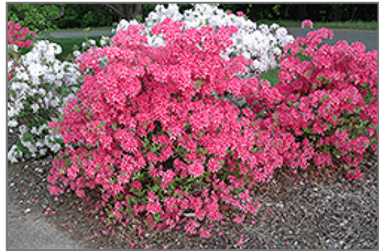
Rosy Lights Azalea in bloom