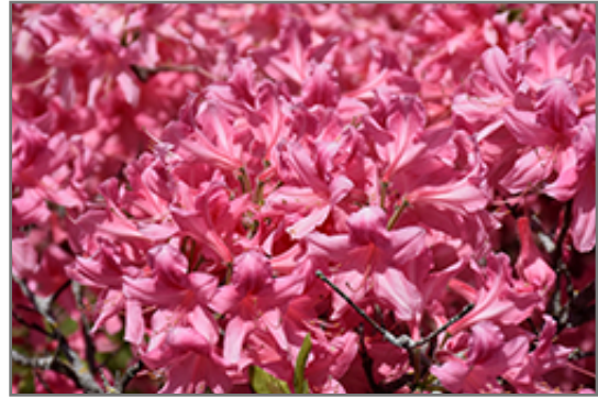
Rosy Lights Azalea flowers

Rosy Lights Azalea is recommended for the following landscape applications;