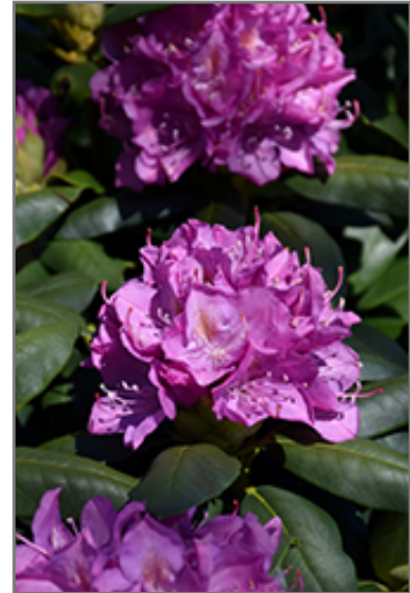
Roseum Elegans Rhododendron flowers