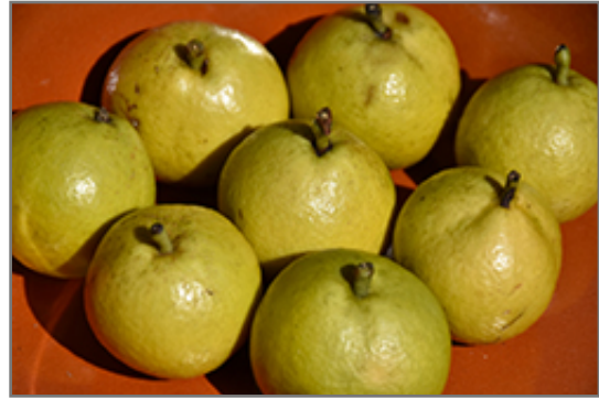
Golden Spice Pear fruit